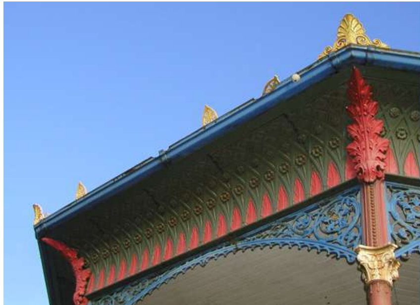
Decorative flanges damaged or missing