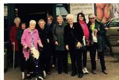
Pictured right: Customer enjoying a recent outing to Glendoick Garden Centre

If you would like to know more about using Food Train services or volunteering with Food Train, please contact us: Tel: 01382 459202 Email to: dundee@thefoodtrain.co.uk