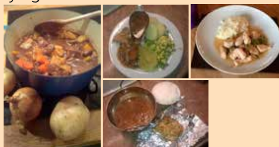
Pictured above some of the lovely meals shared with older people in Dundee and Glasgow.

The very first Meal Makers digital film has been produced with interviews from four diners and their cooks. Asked what Meal Makers meant to them Diners answers varied from enjoyment of the friendship and companionship to excitement of trying new foods. Meal Makers have been back on STV where cooks and diners talked about their experiences of the project. You can see our film on www.youtube.com